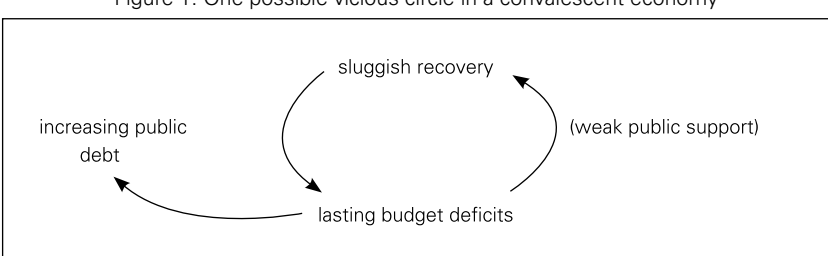
Figure 1: One possible vicious circle in a convalescent economy

Of course, post-crisis economic recoveries use to alleviate public accounts spontaneously to some extent. However, even in the optimistic case of a rapid return to the pre-crisis growth trajectory combined with a rapid reduction of the budget deficit, the level of the public debt is likely to remain higher than the pre-crisis one, for the past deficits do weight the debt burden as long as surpluses do not compensate for them. In the less favorable (but very plausible) circumstances where the recovery process spreads over a long period of time, owed to the weak aggregate demand dynamism and the weak public support, the post crisis growth regime could make it still more difficult for governments to balance their budget. This could in turn allow for a growing public debt, as suggested in Figure 1.